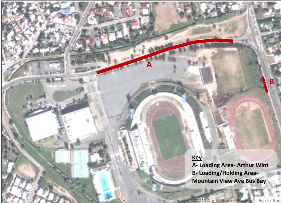
Figure 2- Park Location for JUTC Buses for the Special Post-Event Transport Service

Service will be provided on routes 3A, 12A, 17A, 18A, 20A, 21, 22, 23A, 32, 44, 46, 78, 83, 97, and 99 and will directly serve the following areas (See Figure 3):