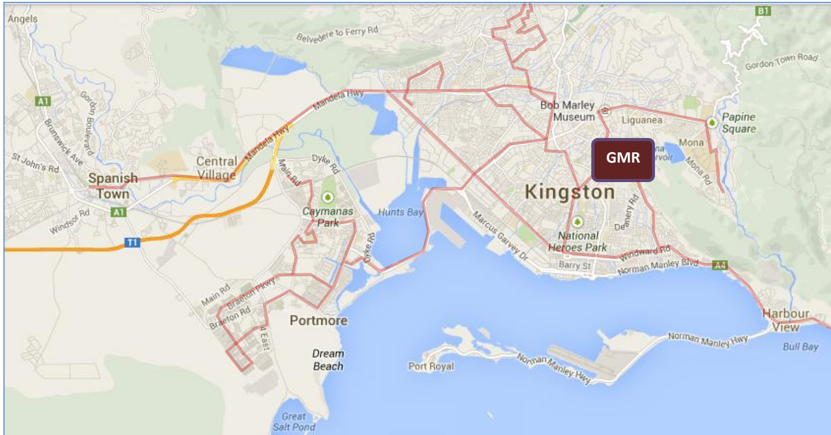
Figure 3- Transport Service Corridors/ Areas for Gibson McCook Relays (GMR) 2017